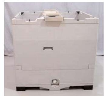
Tote is ready to fill