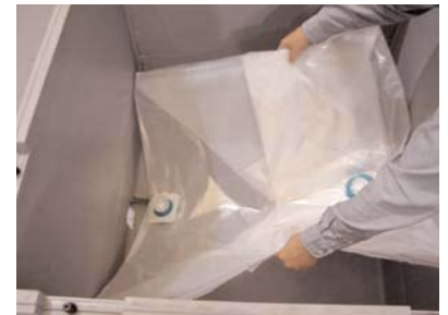
Place liner in container with dispense fitment end in first