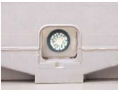
Connect clip to Liquifold tote