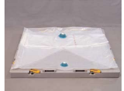
Open liner, keep dispense fitment towards you