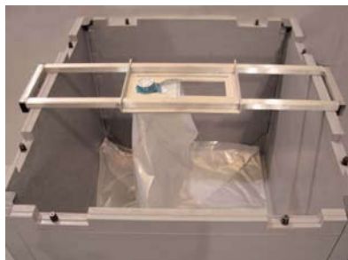
Attach fill fitment to fill bridge