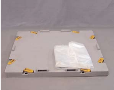
Remove liner from box and place on table

Proper insertion of a CDF form-fit liner into a Liquifold bin.