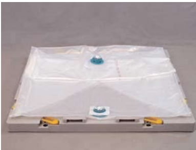
Remove bubble wrap from fill and dispense. Attach Liquifold clip to the dispense fitment